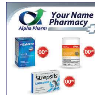
FACEBOOK GROUP PRODUCT POST