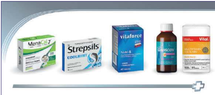
FACEBOOK COVER IMAGE - PROMOTION/PRODUCT SPECIFIC