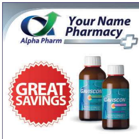
FACEBOOK INSTANT EXPERIENCE