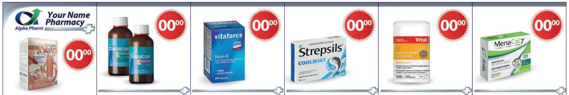
FACEBOOK CAROUSEL PRODUCT POST