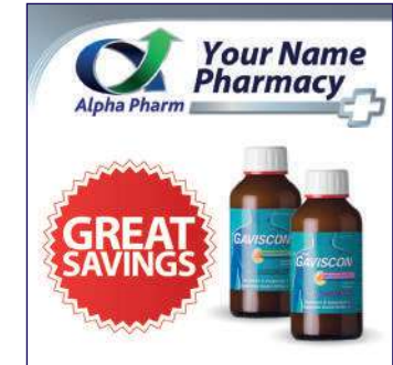
FACEBOOK PAID ADVERT